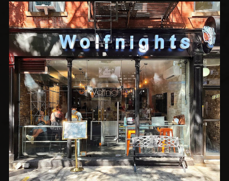
2011 - Our First NYC restaurant

Wolfnights has been franchising since 2024.