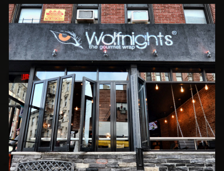
2024 - Our 99 Rivington Street location